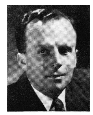
Figure 1. J.C.R. Licklider circa 1960, pictured in the IRE Transactions of Human Factors in Electronics .